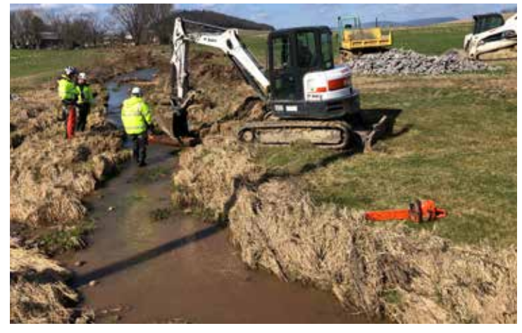
The 2025 'stream season' kicks off at project site on Turtle Creek in Union County.