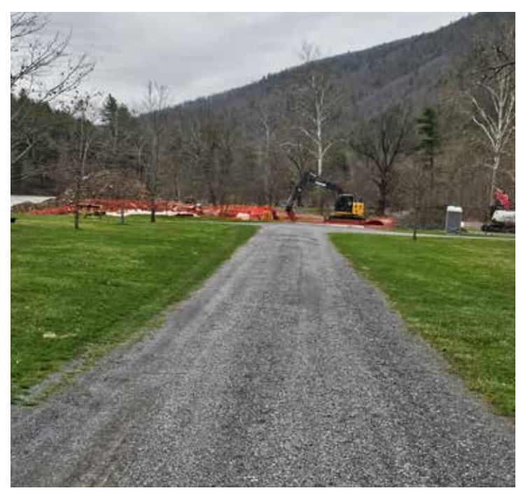
Construction is underway at Tomb Flats to improve stream access and create an ADA-accessible fishing area along Pine Creek.