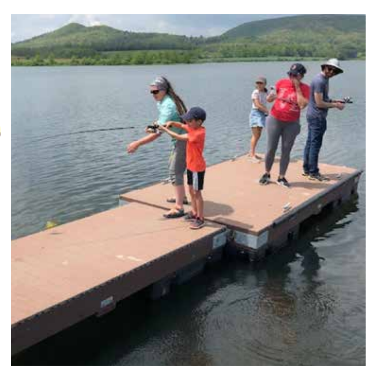
Save the date for the return of Family Fishing Day at Rose Valley Lake with NPC and the PFBC on June 21st!