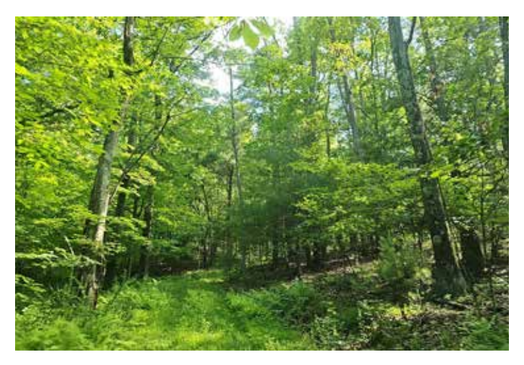
Dickey Farm Conservation Easement, Clinton County

In 2024 NPC was awarded grant funding from WeConservePA to develop forest management plans (FMP) on 9 of our conservation easements. Some of these easement owners have already begun implementing their plans.