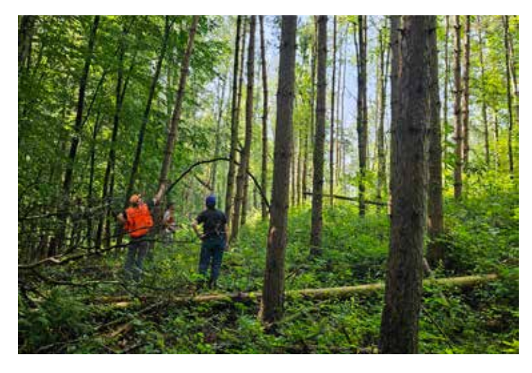
Laning Creek Conservation Easement, Bradford County

The Laning Creek Conservation Easement includes longtime family land and newer additions. Although timber was harvested decades ago, the property never had an FMP until now. During a survey, the forester found a healthy, mature ash tree among many killed by emerald ash borer. Experts collected samples from the tree for research. With the FMP in place, the landowners began applying for cost-share support. In fall 2024, the first treatment to control invasive 'tree of heaven' was completed.