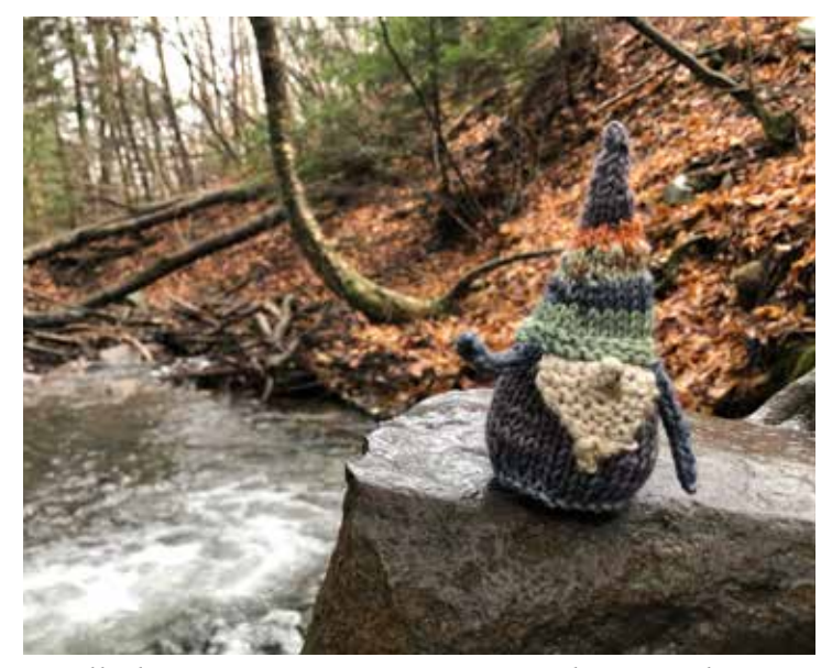
Gnolli the Tioga River Gnome enjoys the view along Coal Creek. He was made during the first Rivers, Coal & Crafts event at the Blossburg Company Store.