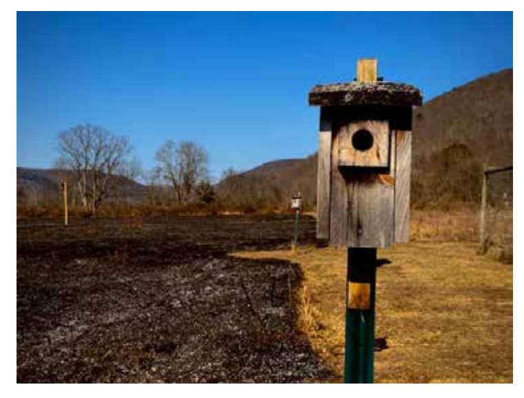
A prescribed fire at the Cavanaugh Access Area helps control invasive species and support native plant restoration along the Pine Creek Rail Trail.

If you're in the area stop by and pay attention to what the vegetation in the burned area looks like compared to neighboring areas that weren't part of the burn.