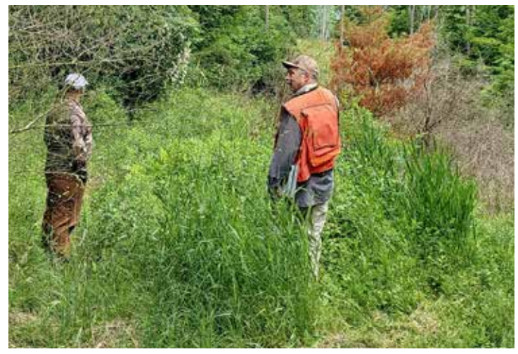
Bednar Conservation Easement, Tioga County

New owners took over the Bednar Conservation Easement in 2023 and were eager to improve forest health and wildlife habitat. One of the goals for their FMP is to create different types of habitats for wildlife. They hired a forester who has prepared a timber harvest plan and will oversee a timber salvage harvest. The owners have also set up three areas that provide food and shelter for pollinators, migratory birds, and other native animals.