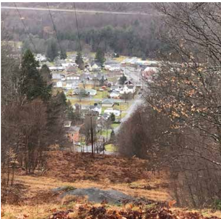
A view of Blossburg from the Coal Creek property.

Stay tuned for more updates and progress! We are partnering with several organizations to host a variety of community events in 2025, providing further updates on our work to restore the Tioga River.