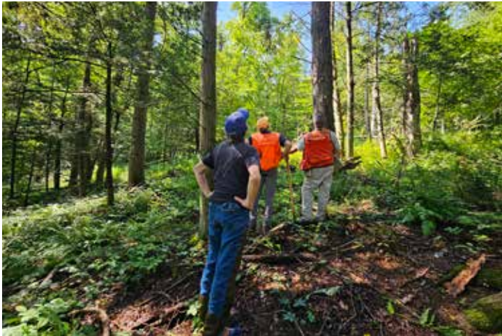
The landowners of the Laning Creek conservation easement walk the property with the Forester, helping to develop a forest management plan.