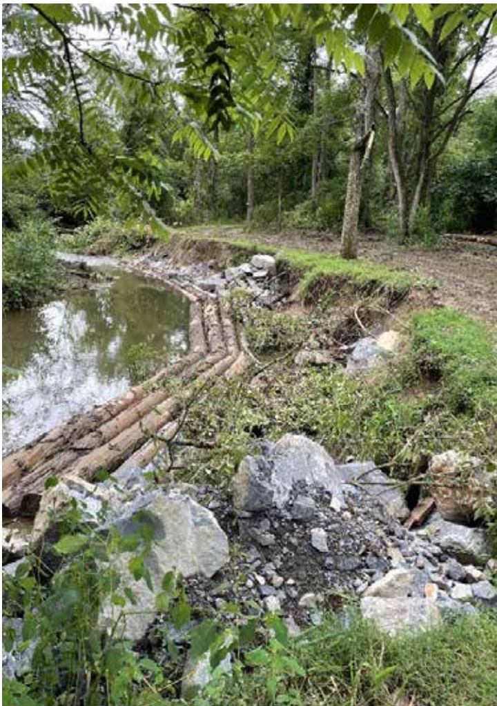
Your support of NPC is helping to restore the health of Warrior Run in Northumberland County.