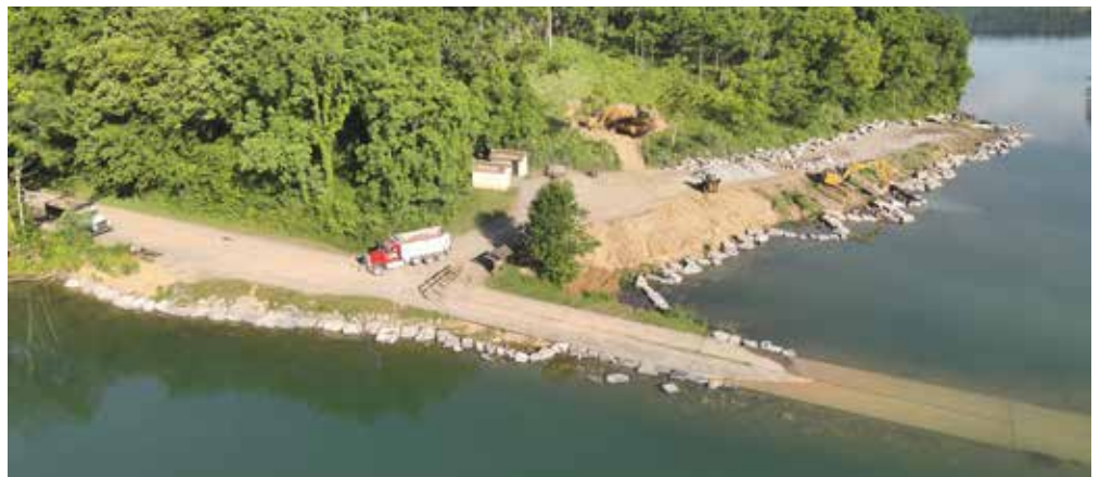
NPC members help restore a section of eroding shoreline at F. J. Sayers Reservoir in Bald Eagle State Park.

You have helped NPC become so efficient and capable at executing streambank stabilization projects, that NPC was asked by the lake habitat section of the Pennsylvania Fish and Boat Commission to help restore a section of shoreline at F. J. Sayers Reservoir in Bald Eagle State Park, Centre County. The team's work at this site not only stabilized the shoreline, but improved fish habitat and access for anglers. For more info visit: www.npcweb.org/npc-helping-to-restore-the-shoreline-at-f-j-sayers-reservoir/ .