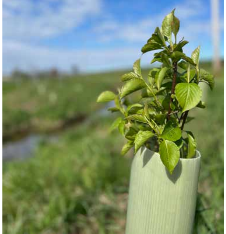
Native trees planted along Turtle Creek stabilize the streambank and provide shade, cooling the stream.