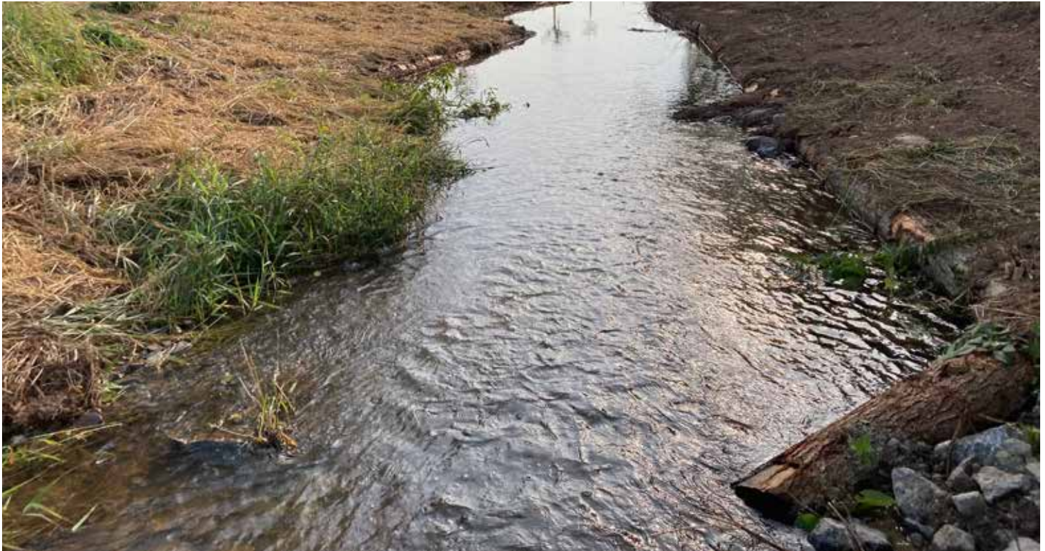
The log structures installed at this site on Susquehecka Creek in Snyder County help ease the pressure on the stream bank and guide the water back to the center of the stream channel.

On the cover: Officials from federal, state, and county agencies, and representatives from NPC and our project partners, gather to celebrate the delisting of 2 segments of Turtle Creek.