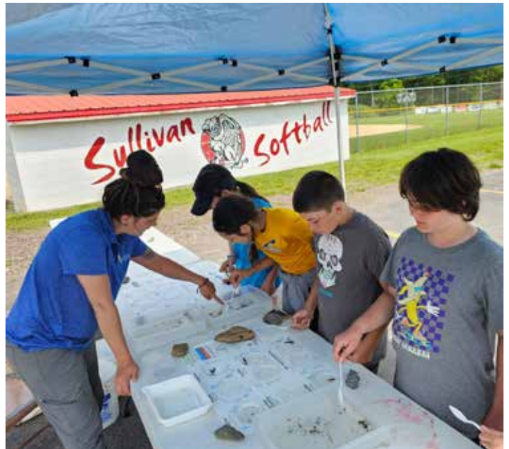
A group of Sullivan County 5th graders learns about macroinvertebrates with NPC.

Thank you for helping to bring these educational opportunities to our schools. We hope the students are now enjoying their summer vacation, splashing around in their favorite creeks, and keeping an eye out for these amazing macros!