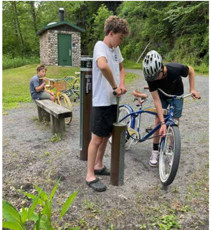
A trio of cyclists stop to use the new bike repair station that NPC members helped install on the Pine Creek Rail Trail.

The repair stations are equipped with tools and air pumps to assist with common bike repairs, ensuring that trail users can quickly address issues such as flat tires and minor mechanical problems. Next time you are out on the Pine Creek Rail Trail, you can ride with peace of mind knowing that these repair stations are available to help with any unexpected bike issues.