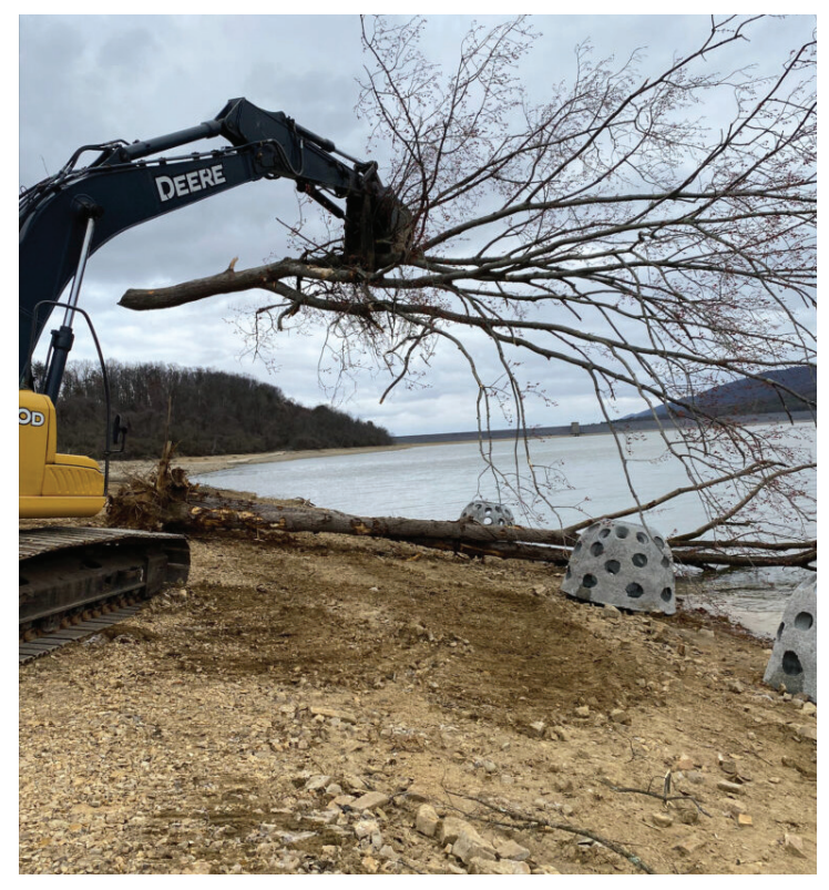
Reef balls and felled trees provide better fish habitat at F. J. Sayers Reservoir.

Recently the Pennsylvania Lake Management Society awarded NPC a grant for one of the more popular areas at the Reservoir. The shoreline work will happen in late