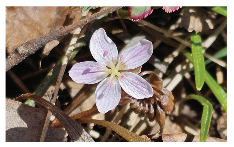
Virginia spring beauty found on Rishel-Grove conservation easement in Columbia County