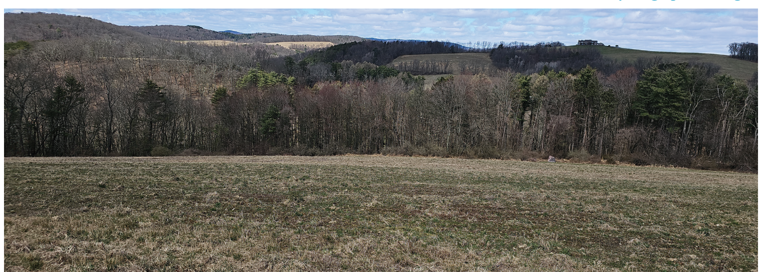
The Green Hills Farm conservation easement in Lycoming County conserves important agricultural soils and provides space for groundwater recharge.

This casual celebration is family-friendly, and all are welcome! Registration is encouraged, not required. To register or if you have questions, please contact the NPC office at 570-323-6222 or <a href="https://hbyers@npcweb.org">hbyers@npcweb.org</a>.