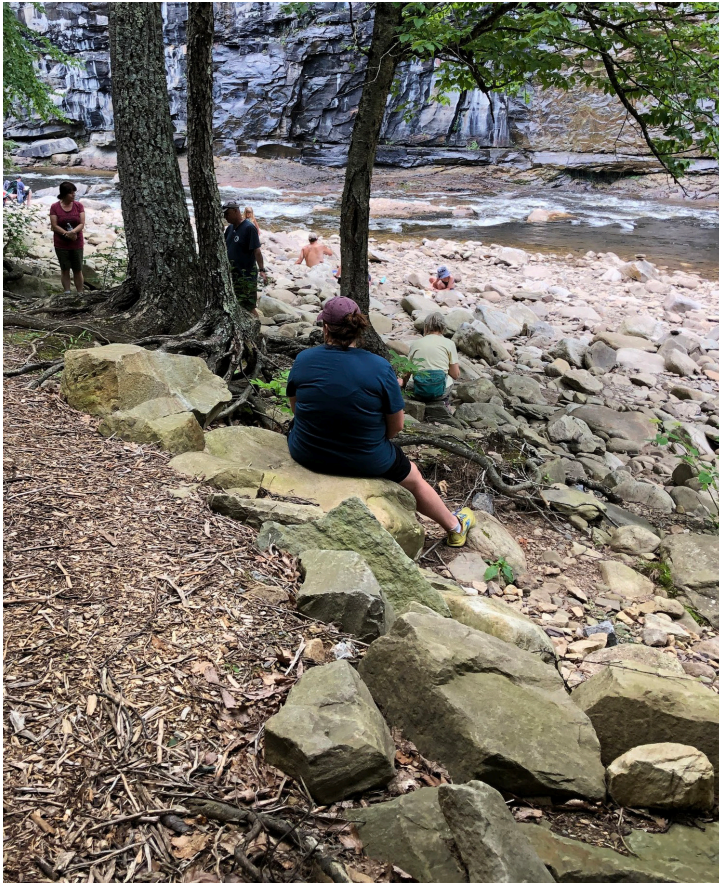
Forest Bathing at Worlds End State Park.

From Fly Fishing to Forest Bathing, THANK YOU for helping to spread the NPC mission and share the joys of nature at a variety of educational events and festivals this summer!