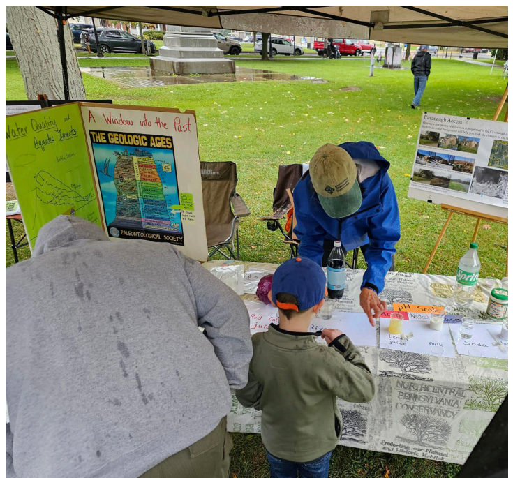
Sorting macroinvertebrates at the Hometown Science Series & Festival.