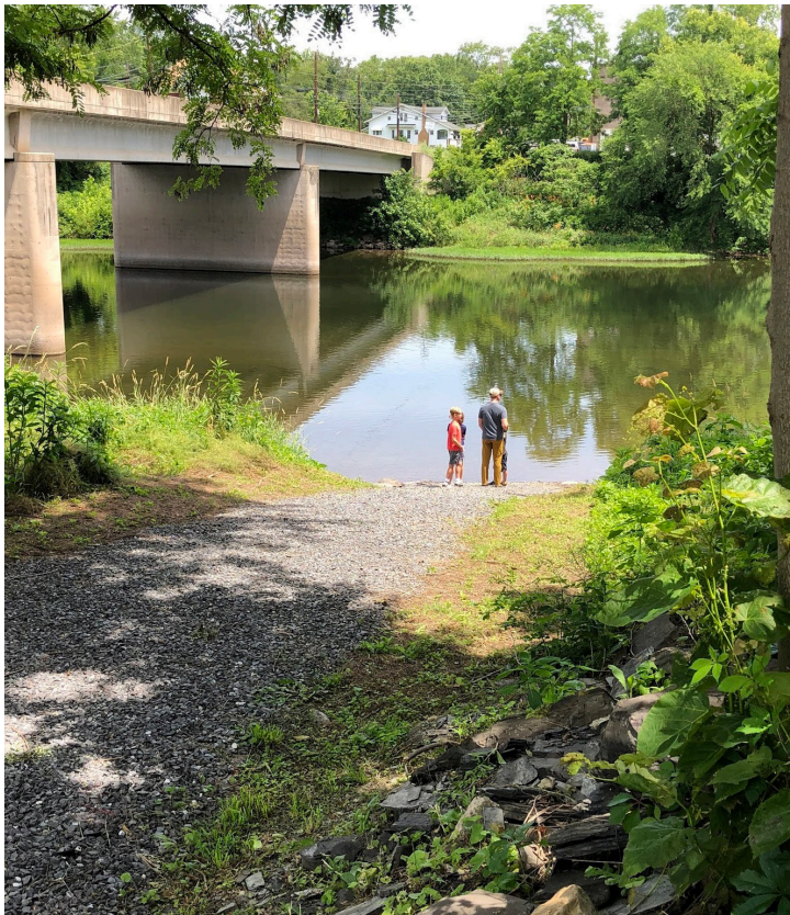
NPC helped conserve the Phelps Mills Canoe Access (seen here) in Clinton County.

Reservations can be made online at npcweb.org , by calling the NPC office at 570-323-6222, or by mailing a check to the NPC office.