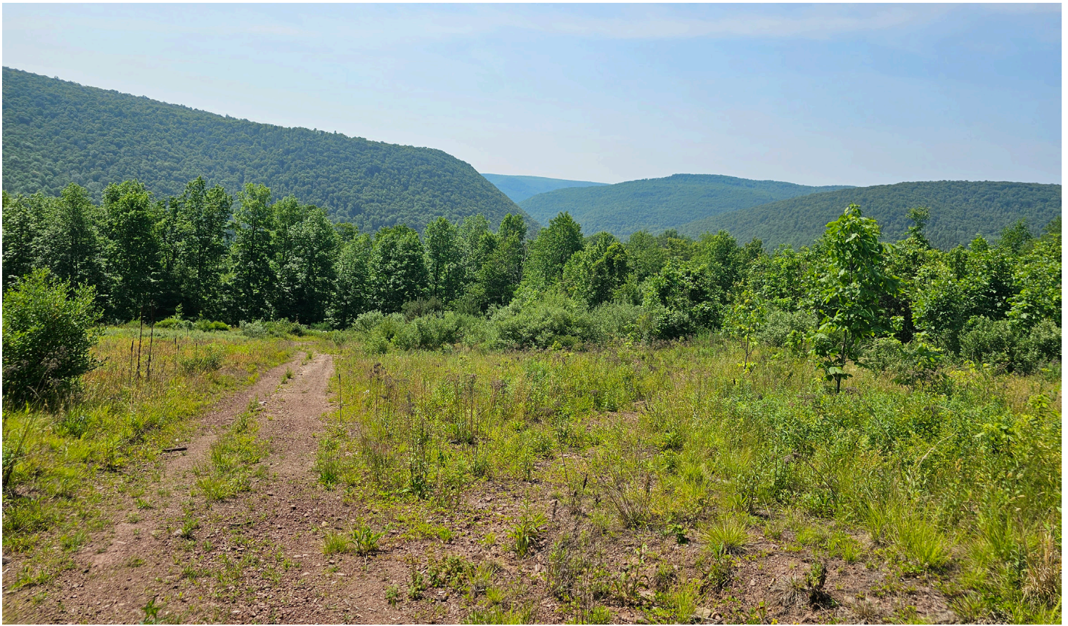
View from the recently conserved 'Anderson Hill' property, looking south towards SGL 134.