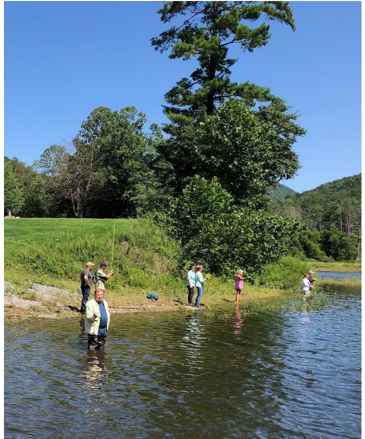
Fly fishing at Little Pine State Park.