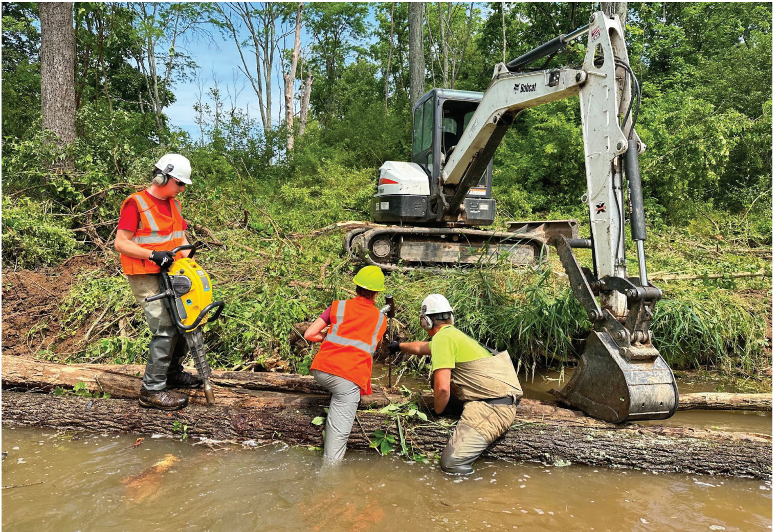
The crew from PA Fish and Boat Commission and Union County Conservation District secure the logs with rebar.