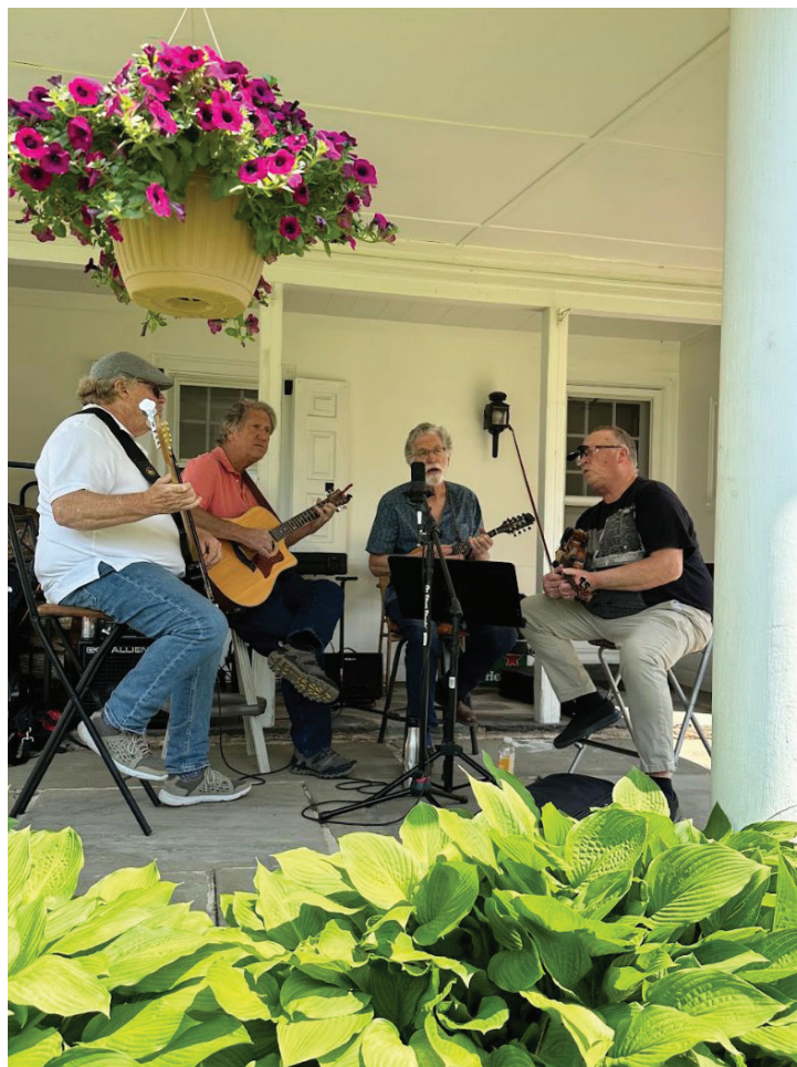
The Knarly Knuckles kept the music going and had some guests dancing in the yard!