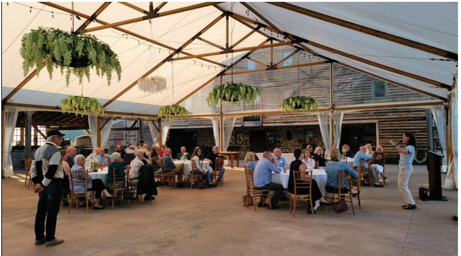
The patio at Herman & Luther's was a great setting for some wonderful food!