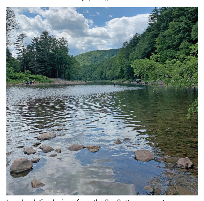
Loyalsock Creek views from the Bar Bottom property.

So, just about 4 months after the thrill of winning the highest bid at auction, we're proud to report that NPC officially took title to the property on October 6, 2020! Soon, we will begin working with the Bureau of Forestry (BOF), who will take over the