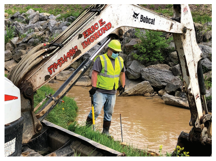
The 2020 stream season may have looked a little different, but the team pressed on!

Given how many things didn't go as planned this year, everyone in the stream partnership is amazed at how much we got done. There were hiccups along the way. One project had 2 skid steers break down and a track come off the third. There was also the project that a boulder (the size of a Mini Cooper) was discovered while putting in a stabilized stream crossing. However,