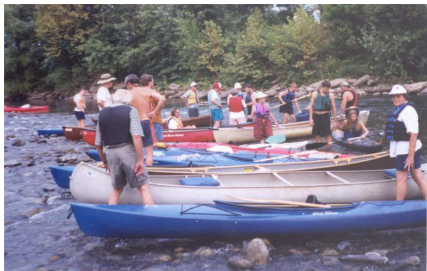
A group of canoeists enjoy a break during one of NPC's summer paddling clinics. Watch the spring 2002 issue of the newsletter for the dates of next summer's clinics.