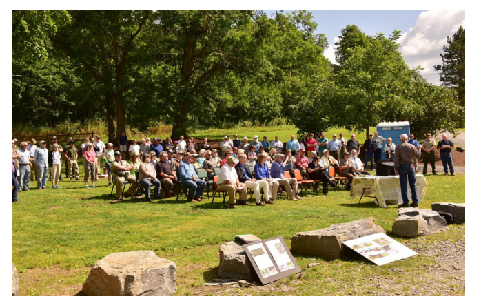
A great turnout for the Cavanaugh Access dedication!