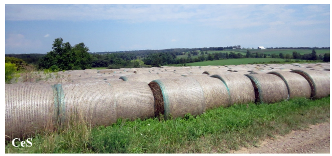
Above: Annual crop from Rogers easement.