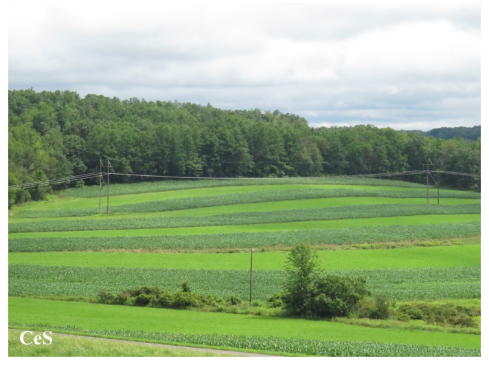
Above: The Shumway property in Bradford County protects the cropland.

This year those soils are growing both soybeans and corn. By conserving working farms, members of NPC also conserve productive agricultural soils and local businesses that provide goods and services to the farming community.