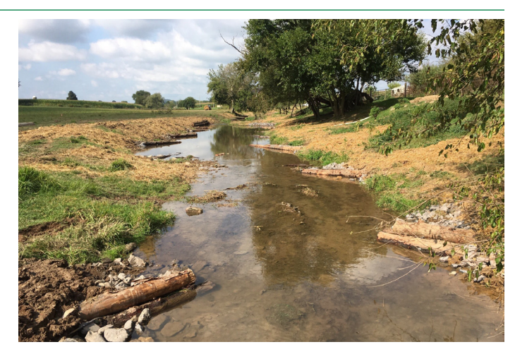
Above: The single log vanes used to stabilize the left stream bank.