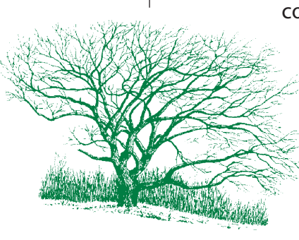
Conserving working farms and forests

ROGERS – The fields of the farm on the Rogers conservation easement produce an annual crop Continued on page 3