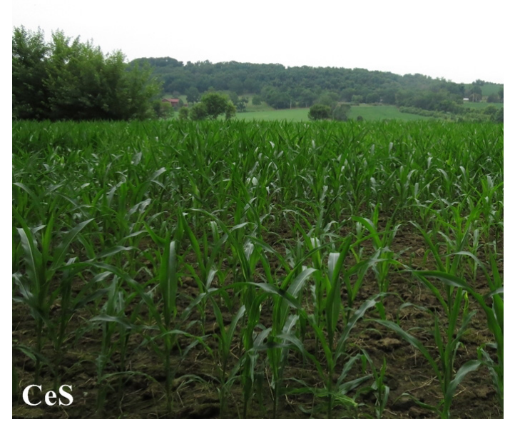
Above: The Chillisquaque Creek flows through the Mexico Road easement, supplying water to prime farm land.

MEXICO ROAD - In Montour County the Mexico Road conservation easement has over 700 feet of Chillisquaque Creek flowing through it. The Creek is adjacent to fields with prime agricultural soils.