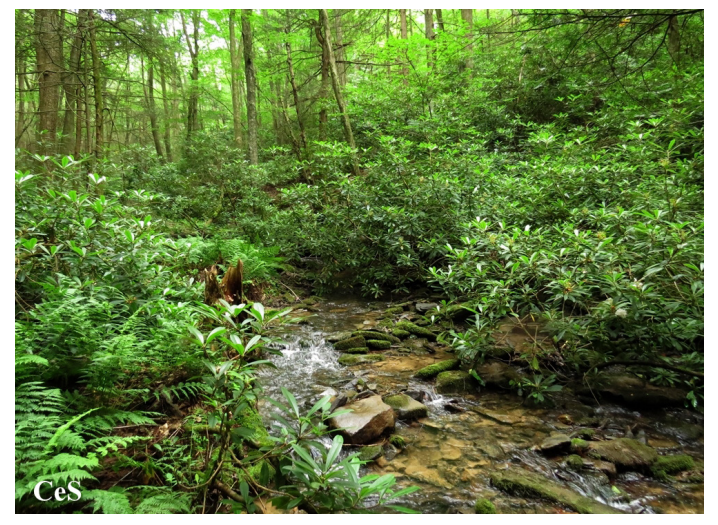
Above: The Morgan Valley Road easement provides a population of native brook trout.

trout, a species imperiled by habit loss and climate change. The property's hemlock forest and dense stands of native rhododendron shade the stream, keeping the water at the low temperatures required by brook trout. The easement requires that a buffer be maintained along the stream during any forest management activities.