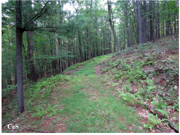
Above: Visscher easement access road.

VIANI – For years there's been a large beaver pond on Riley Creek which flows through the Viani easement. Most beaver colonies eventually devour all the available food and the animals relocate to a spot that will support them. Apparently that's what happened to this colony, so the dam has deteriorated to the point that the pond is almost dry. Eventually trees will recolonize the dried-up pond and beavers will move back.