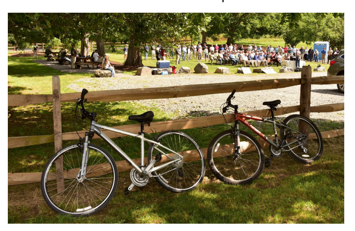
Some folks took advantage of the beautiful weather to ride their bikes to the dedication.