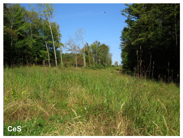
Above: The John F. Logue easement following reseeding.

VISSCHER - This road on the Visscher easement was constructed to aid in managing the woodland. It was well constructed with proper drainage and now supports grasses and other low-growing plants. The good design, proper drainage and vegetation keep heavy rainfall from causing erosion, which would damage the road and deposit silt in the nearby stream. Keeping working woodlands intact is one of ways NPC's members help conserve this region.