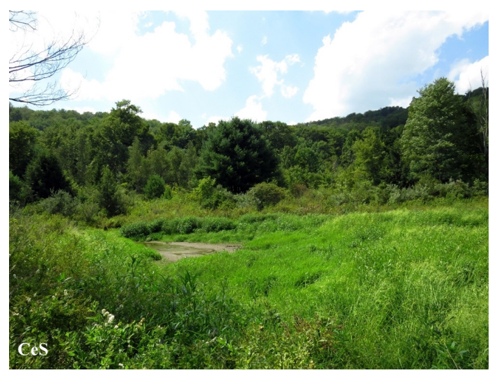
Above: The Vivani easement beaver pond all but gone.

of hay. During the monitoring visit to the property the bales were neatly lined up along the road awaiting the truck that would haul them away to another farm. The Rogers easement also includes woodland, small wetlands and the scenic views from several public roads.