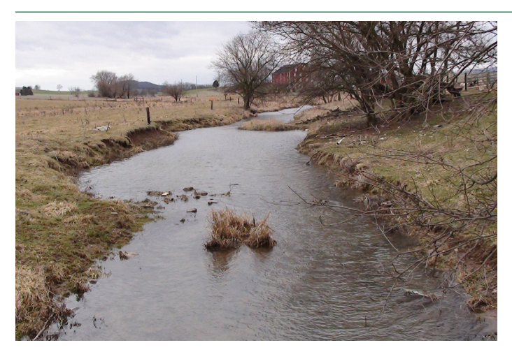
Above: The eroding stream bank visible on the left hand side of the stream.