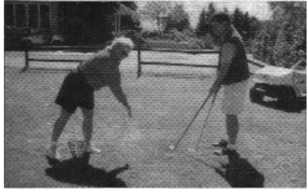
The 5th Annual Autumn Classic Golf Tournament was a fun way to show support for NPC's mission!