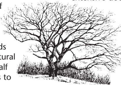
Conserving working farms and forests